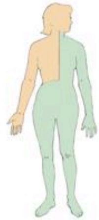
(b) Areas drained by right lymphatic and thoracic ducts

Orange: Area drained by right lymphatic duct Green: Area drained by thoracic duct